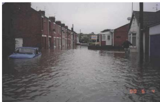
Flooding poses a serious risk to human life.

Although we can reduce the risk in many locations, we cannot prevent all flooding – there is always the possibility that extreme events will overtop or breach any defences. We must make sure we are as well prepared as possible to deal with the impacts. At the national level, Defra has the lead role in Government for flood emergencies and our lead department plan sets out the co-ordination arrangements at local, regional and central levels for flooding from rivers or the sea. The Government has set up regional resilience teams in each of the English regions to enhance the co-ordination of planning for wide impact events, such as major flooding.