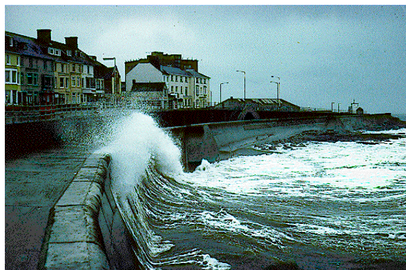
Storm events are expected to increase as a result of climate change.

Potential changes in our climate look likely to include more severe storms and more intense winter rainfall. This, together with sea level rise, will tend to increase the probability of flooding and coastal erosion. Defra gives guidance to the operating authorities to ensure this is taken into account in decisions now. More fundamentally we want to reduce the impacts of climate change through control of 'greenhouse' gas emissions.