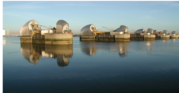
EA's Thames Barrier will reduce the risk to London until well beyond 2030. Their Thames Estuary 2100 project is preparing a strategy to the year 2100 for the future management of flood risk.

The EA is the principal flood risk management operating authority, with permissive powers (as opposed to a legal obligation) to manage flood risk from designated main rivers and the sea. The EA is also responsible for increasing public awareness of flood risk, flood forecasting and warning and for general supervision of all matters relating to flood risk management. We agree targets with EA annually which are set out in its corporate plan.